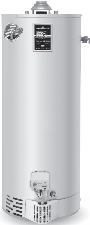
Photo is of URG250T6N