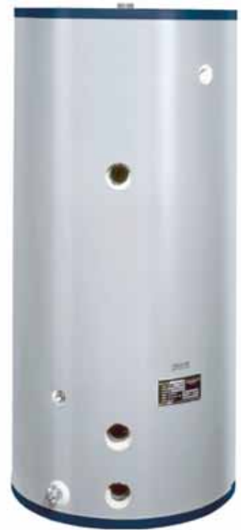
ASME (on select models)