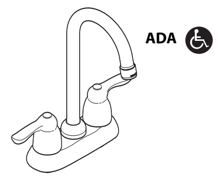
Two-Handle Bar Faucet

Warranted for 5 years against material or manufacturing defects