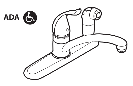
CHATEAU° Single-Handle Kitchen Faucet w/Protégé Side Spray in Deck Plate