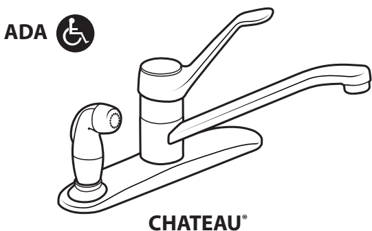
Single-Handle Kitchen Faucet w/Protégé Side Spray in Deck Plate

Models: 7434, 7434S, 7434SLP, 7434V, 7434W, 87434, 87434W, 87434SLP