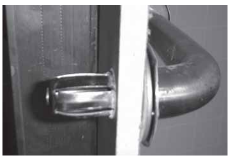
Picture Above Shows the WingIt™ as it would look inserted into the wall.